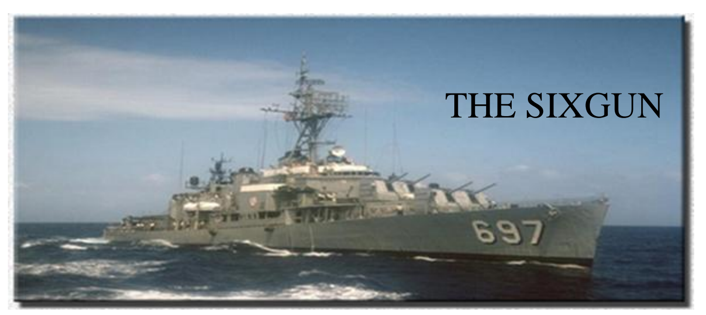
Vol. XX Issue 35 Official Newsletter of the USS Charles S. Sperry DD 697 Association October 2012